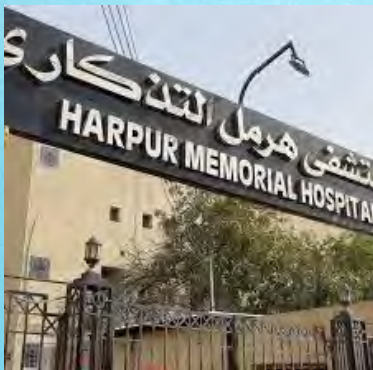
Harpur Memorial Hospital

The CMDA Dietz Scholarship provides financial assistance to support the Christian professional and educational leadership development of physicians and dentists in low and low-middle income countries and regions of the world. Applications available until March 31st and October 31st each year at this link .