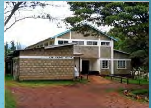
Kapsowar Mission Hospital