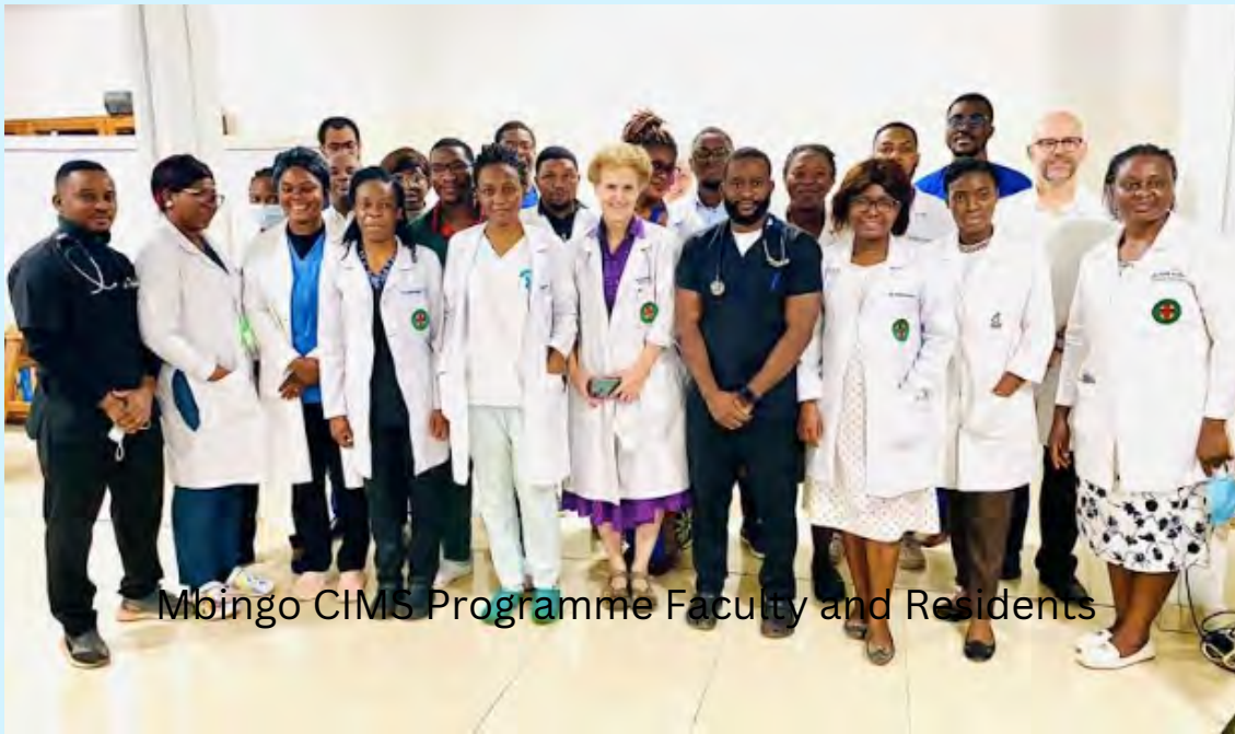
Mbingo CIMS Programme Faculty and Residents